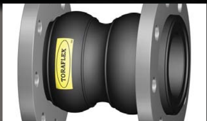
Full turned rubber design, self-sealing, no additional gaskets are required. It prevents electrolytic corrosion

Rubber Joints are excluded from the Pressure Equipment Directive PED 97/23/CE, according to its article 1.3-15. WRAS approval for drinking water, series S10, S15, S20 & S30, standard up to DN400!