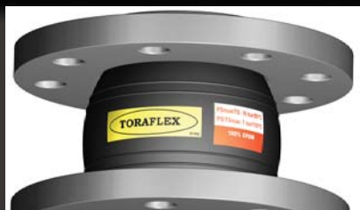
Rubber material identification and maximum service pressure and temperature.